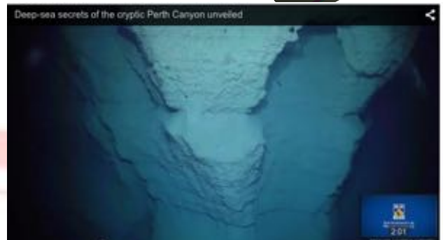
Perth Canyon undersea wall

During the trip to Perth Canyon, researchers encountered countless deep-sea organisms , including Venus flytrap anemones and golden coral. They even found a lost piece of equipment — an autonomous ocean glider that had gone missing two years earlier.