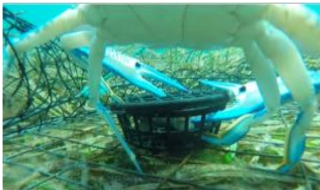
A crafty crab takes the bait and runs.