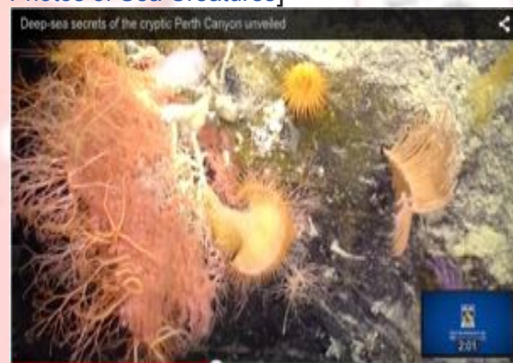
Deep-sea anemone from Perth Canyon (Above & below)

The scientists, from the University of Western Australia's Oceans Institute, began their mission on March 1 on the Falkor, a research vessel owned by an American nonprofit organization. Once aboard, they sailed about 19 miles (30 kilometers) from Fremantle, a city on the western Australian coast. They then used a remotely operated vehicle to explore the underwater canyon , which extends from the continental shelf down more than 2.5 miles (4 kilometers) to the ocean floor. [ Marine Marvels: Spectacular Photos of Sea Creatures ]