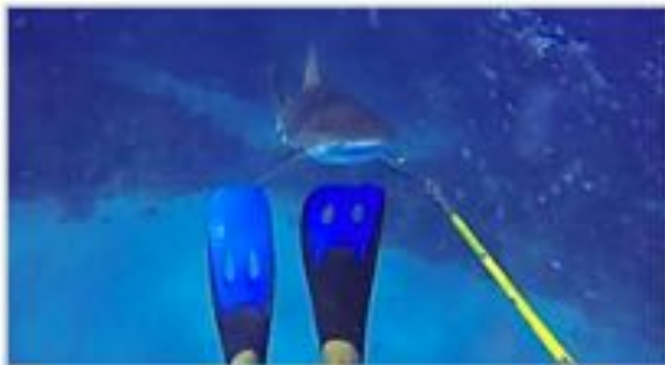
Diver fends off a shark attack in Caribbean Sea; photo is a screen grab from the video

A diver off the Cayman Islands in the western Caribbean Sea was suddenly forced to fend off a shark attack with the pole spear he had been using to cull the area of the invasive and destructive lionfish. A Caribbean reef shark came out of nowhere, scaring the bejesus out of diver Jason Dimitri, who had just speared a lionfish in about 70 feet of water. Watch as the normally shy reef shark goes after Dimitri, who does a commendable job in defending himself: