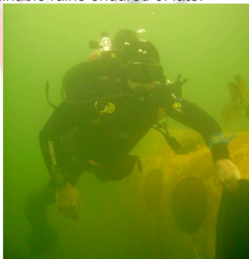
Diver Donn in glory!

On successive dives in May the Tuesday night crew of Randy Beck, Jeff Dye, and I, followed on Sunday by Donn Ellerbrock and yours truly, spotted all of the big catfish and a few smaller ones in various stages of display, as they disported themselves in the warming waters by stretching out on the catamaran and nearby motor boat, the small wooden boat near the lady in the tub, under the nose of the single engine plane, the Cessna fuselage, and even the front staircases by the pavilion. Visibility has ranged from a high of 20+ feet to a low of about 5'-7' most recently due to the interminable rains endured of late.