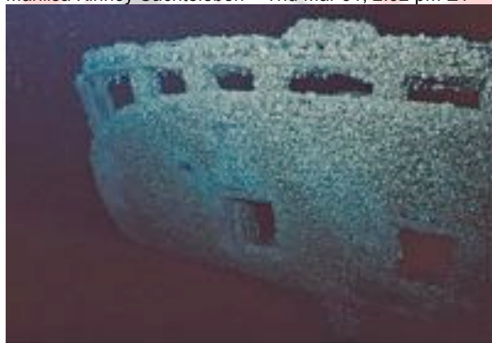
In this 2010 photo taken from video and provided by Michigan Shipwreck Research Associates, the stern