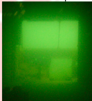
Inside the Frito Lay truck