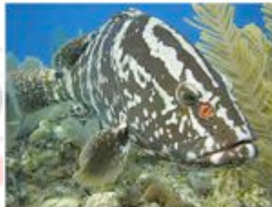
The Nassau grouper is an iconic Caribbean reef fish threatened by overfishing.

Nassau Grouper Showing Signs of Recovery Since Caymans Islands Protections