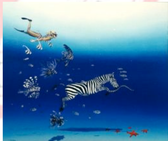
STARS AND STRIPES

I have made almost 200 solo exhibitions since 1977, in 15 different countries (if world-renowned means something...).